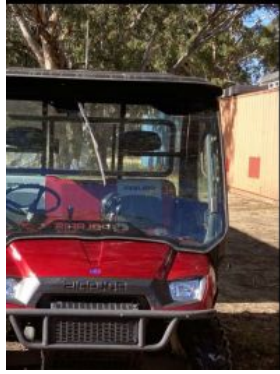
Outside Entry 1- Carlora Pastoral