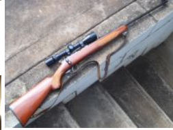
Outside Entry - Ian Evans