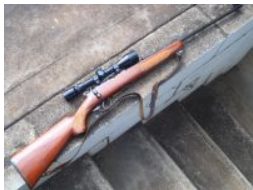
Outside Entry - Ian Evans