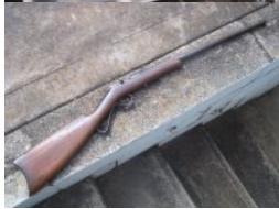
Outside Entry - Ian Evans