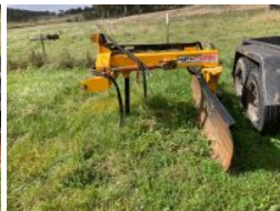
Outside Entry - R & W Crowe