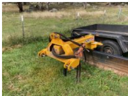
Outside Entry - R & W Crowe