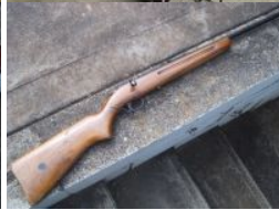
Outside Entry - Ian Evans