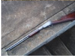
Outside Entry - Ian Evans