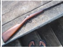
Outside Entry - Ian Evans