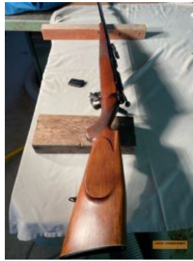
Outside Entry 1 - P Fischer