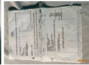
Outside Entry 1 - P Fischer