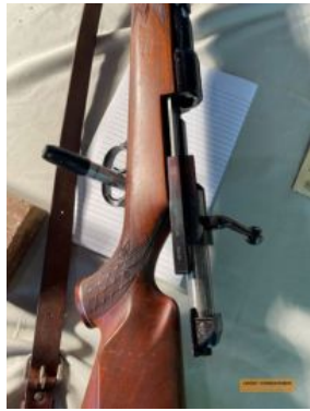
Outside Entry 1 - P Fischer