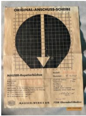
Outside Entry 1 - P Fischer