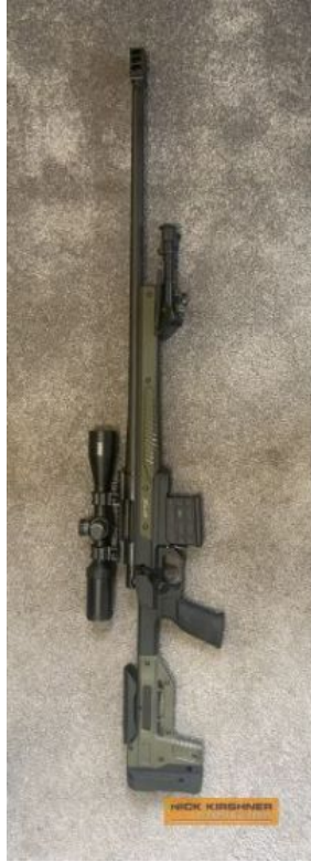
Outside Entry 4 - J Maloney