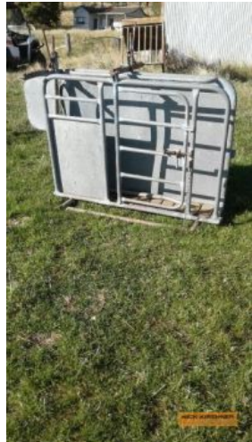
Outside Entry 5 - GM & SM Williams