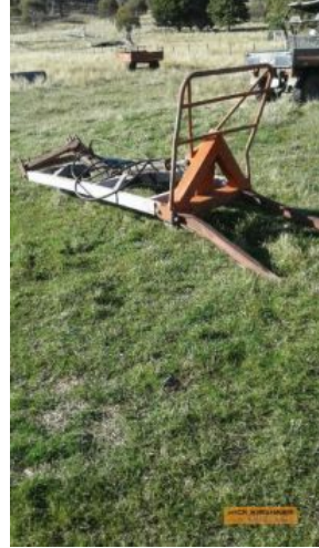
Outside Entry 5 - GM & SM Williams