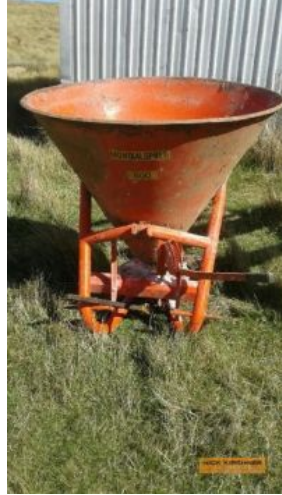
Outside Entry 5 - GM & SM Williams